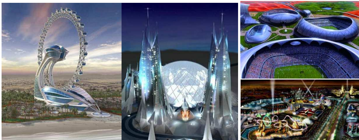
Figure 4- Dubailand: Dubai thematic park - the dream of the future ( http://www.noandishaan.com )