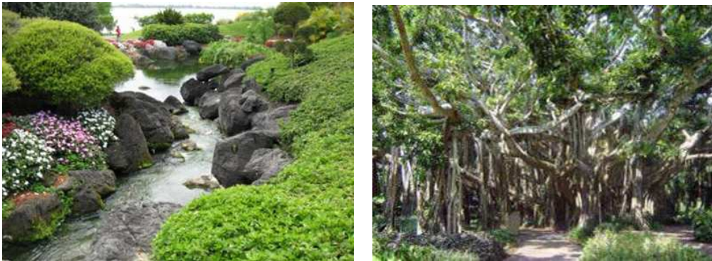
Figure 3- Banyan tree in Cypress Gardens: Sample of theme park ( http://www.noandishaan.com )