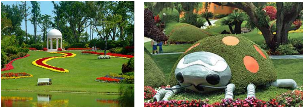
Figure 3- Gazebo famous Park - an example of pruning and flower ( http://www.noandishaan.com )